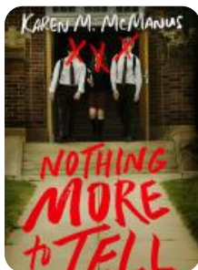
Nothing More to Tell Karen M. McManus Murder Mystery