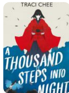
A Thousand Steps into Night Traci Chee Fantasy Fiction