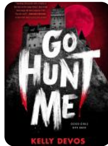
Go Hunt Me Kelly DeVos Horror/Paranormal Fiction