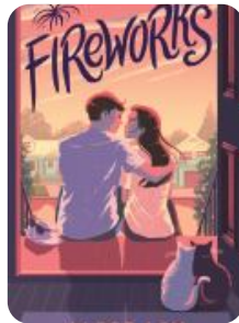
Fireworks Alice Lin Realistic Fiction