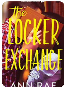
The Locker Exchange Ann Rae Realistic Fiction