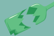
GLASS OF ANY KIND