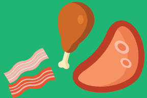
MEAT & BONES