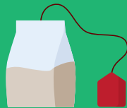
COFFEE GROUNDS, FILTERS, & TEA BAGS