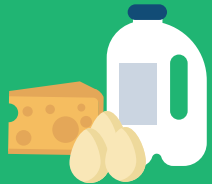
EGG SHELLS & DAIRY