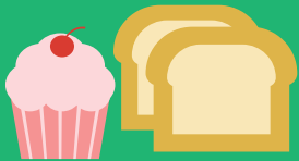
BREADS & CEREALS