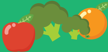
FRUITS & VEGETABLE SCRAPS