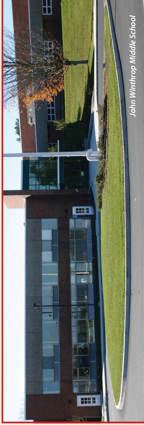
John Winthrop Middle School