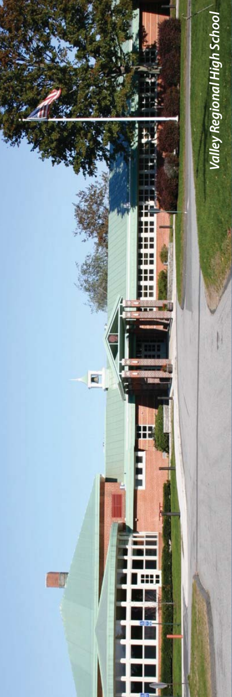
Valley Regional High School